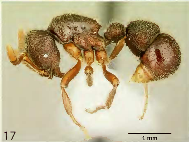
FIGURES 14-17. Proceratium google worker: holotype CASENT0100348.